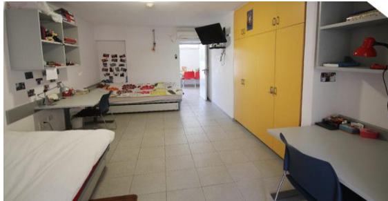
Inside an Einstein dorm room

Prices are 600 USD month for a shared room, utilities and municipal tax included. Students who are living in the dorms are expected to sign a contract and pay in advance. Students who wish to room with a friend may indicate this on their Confirmation Form.